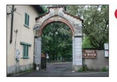
SAN GIORGIO AL LAMBRO Ingresso Parco Reale di Monza

SAN GIORGIO AL LAMBRO Monza Royal Park Entrance