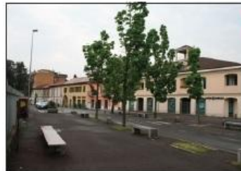
8 PIAZZA L. DAELLI Incrocio percorso verde e rosso

L. DAELLI SQUARE Here crossing the green and the red routes