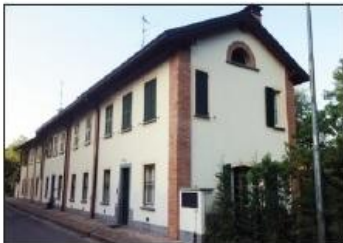
4 MOLINO SESTO GIOVINE