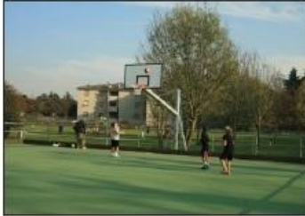
2 PARCO GIUSEPPE SALA Via G. Segantini