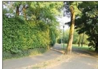
7 CICLABILE GHIRINGHELLA