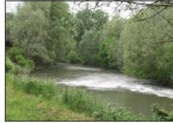
5 FIUME LAMBRO MOLINO SESTO GIOVINE

SANT'ALESSANDRO CHURCH Sant'Alessandro Square