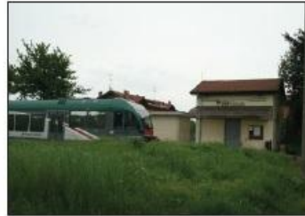
6 STAZIONE BUTTAFAVA Via Molino Sesto Giovine

BUTTAFAVA RAILWAY STATION Molino Sesto Giovine Road