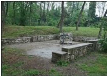
3 BASE SCOUT Via E. Toti

BUTTAFAVA RAILWAY STATION Molino Sesto Giovine Road