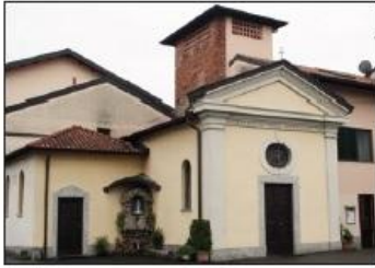
1 CHIESA SANT'ALESSANDRO Piazza Sant'Alessandro

SANT'ALESSANDRO CHURCH Sant'Alessandro Square