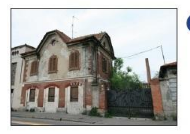
FABBRICA TRONCONI Via G. Garibaldi

FOUNTAIN OF IRRIGATION DITCHES F. Camperio Square