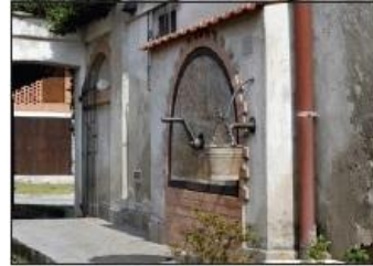
6 POZZO Via San Fiorano