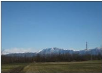
4 PARCO DELLA CAVALLERA

Farmhouse CASCINA SAN FIORANO San Fiorano Road