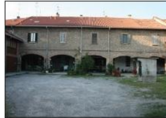
7 CASCINA SAN FIORANO Via San Fiorano

Farmhouse CASCINA RECALCATE C. Menotti Road