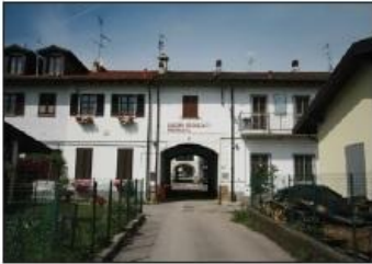
3 CASCINA RECALCATE Via C. Menotti

Farmhouse CASCINA RECALCATE C. Menotti Road