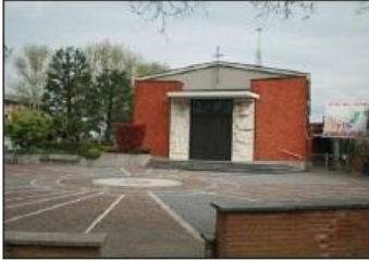
1 CHIESA DI SAN FIORANO Piazza Paolo VI