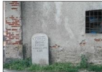
8 ANTICO CIPPO ROMANO Via San Fiorano

ANCIENT BOUNDARY MARKER San Fiorano Road