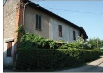
5 CASCINA AUTUNNO Strada dei Boschi

Farmstead CASCINA AUTUNNO del Boschi Road