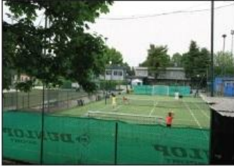
2 CAMPO SPORTIVO M. CASTOLDI Via G. Mameli

Farmstead CASCINA AUTUNNO del Boschi Road