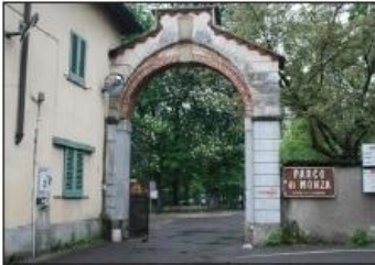
3 SAN GIORGIO AL LAMBRO Ingresso Parco Reale di Monza

SAN GIORGIO AL LAMBRO Monza Royal Park Entrance