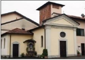
1 CHIESA SANT'ALESSANDRO Piazza Sant'Alessandro

SANT'ALESSANDRO CHURCH Sant'Alessandro Square