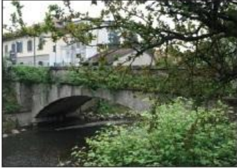
2 PONTE SUL FIUME LAMBRO Via F. Baracca

BRIDGE ON THE LAMBRO RIVER F. Baracca Road