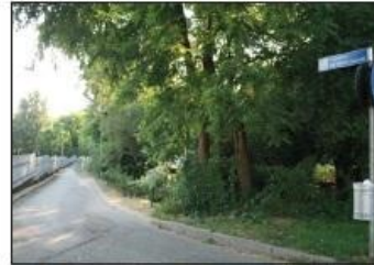
7 CICLOPEDONALE MULINI ASCIUTTI

SAN GIORGIO AL LAMBRO Monza Royal Park Entrance