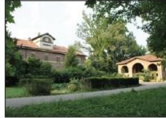
6 MULINI ASCIUTTI Parco Reale di Monza

BRIDGE ON THE LAMBRO RIVER F. Baracca Road