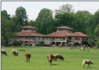
4 MULINI SAN GIORGIO Parco Reale di Monza