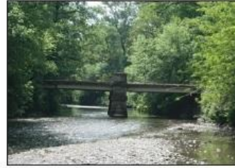
5 PONTE DEI BERTOLI Parco Reale di Monza

SANT'ALESSANDRO CHURCH Sant'Alessandro Square