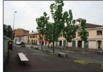
8 PIAZZA L. DAELLI Incrocio percorso verde e azzurro

L. DAELLI SQUARE Here crossing the green and the light blue routes